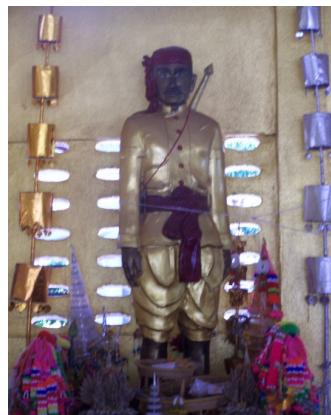
Figure 8: Chao Luang Kham Daeng statue at Phayao province

However, power does not stand still but can move and be transferred. It can be seen that, previously the Chiang Mai city governors held the ritual to legitimize their power but today the ritual is held by the villagers. The ritual is a tactic of local people in forming social networks and thus has other kinds of effects on the community. Even though later the state tried to control the ritual, the state's role and power could only be realized in some parts of the ritual, not with the whole. The idea of building the statues of important