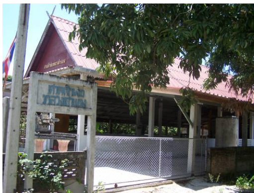
Figure 5: Shrine at Ton Phueng village