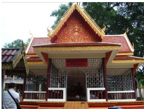
Figure 1: Shrine at Ban Tham village

Since Chiang Dao district is directly connected to the belief of Chao Luang Kham Daeng, this district can be considered an important area for studying the belief, which is still strong in that area.