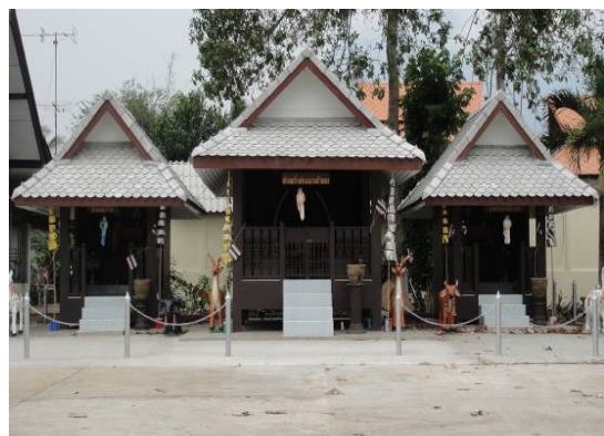
Figure 4: Shrine at Mae Na village

There are four shrines of Chao Luang Kham Daeng in Chiang Dao district, i.e., at Kaeng Pan Tao/แก่งปันเต้า/ village, Mae Na/แม่นะ village, Ban Chiang Dao/บ้านเชียงดาว village and in front of Chiang Dao cave, Ban Tham/บ้านถ้ำ village. The spirit-offering rituals for Chao Luang Kham Daeng are held at these four shrines, during the Songkran festival (Thai New Year), however on a small scale. The grander