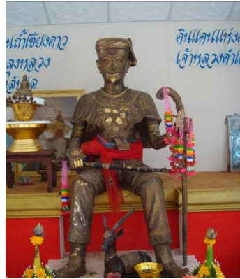
Figure 7: Chao Luang Kham Daeng statue at Chiang Mai