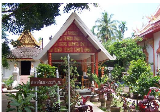
Figure 6: Shrine at Photharam temple

There are two Chao Luang Kham Daeng shrines in Mae Jai district. One is at Ton Phueng/ต๋นผึ่ง village, Srithoi sub district/ตำบลศรีถ้อย and the other one is in Photharam temple which is the main temple of Srithoi sub district of Mae Jai district. In Ton Phueng village, spirit offering rituals are held three times a year at the Chao Luang Kham Daeng shrine. The first is on the 13 th waxing moon day of the 5 th month (3 rd lunar month), the second, is also on the 13 th waxing moon day, of the 7 th month (5 th lunar month). The rituals held on these two occasions are not as grand as the third. The ritual committees bring only vegetarian food to present to the spirit at the shrine; a small group of villagers come to join the ritual. In comparison, the third ritual held annually on the 13 th waxing moon day of the 9 th month (7 th lunar month), is a grand ritual in which a large number of the villagers in Mae Jai district and from other provinces who respect Chao Luang Kham Daeng come to participate.