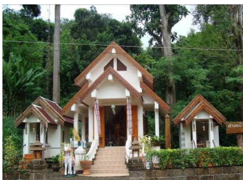
Figure 2: Shrine at Kaeng Pan Tao village