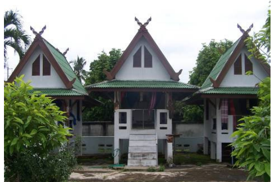
Figure 3: Shrine at Ban Pa Sak Chiang Dao village