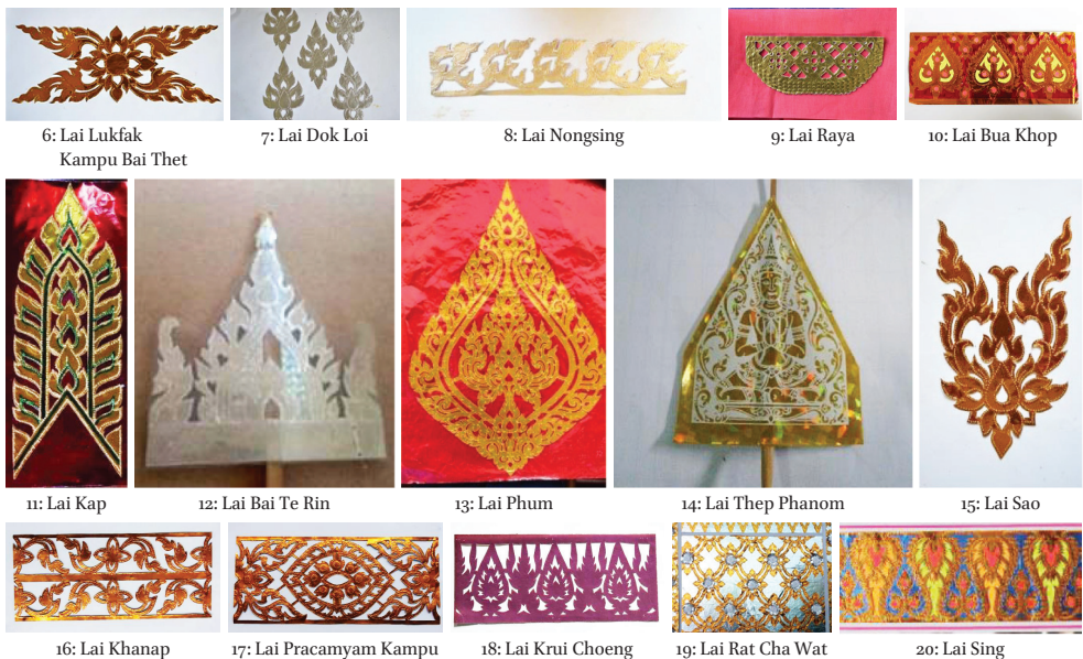
FIGURES 6–20 Thai pattern of intricate paper cutting techniques from Songkhla and Nakhon Sri Thammarat Provinces (Virunanont 2015)

The techniques used include boring through the paper, engraving the bored paper onto coloured paper, and cutting through the foil and attaching coloured papers to create multiple shades. (See Figures 6–20)