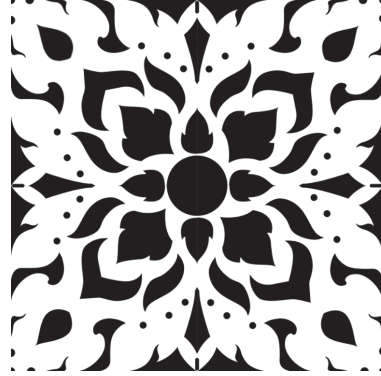
FIGURE 3 The Pracamyam Pattern (Conjoined)