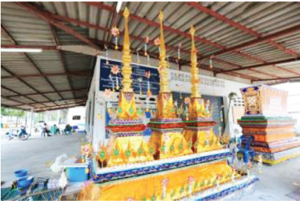
FIGURE 28 Artisan Name: Suan Nudla