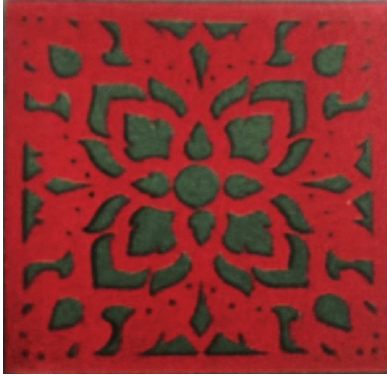
FIGURE 2 The Pracamyam Pattern (Conjoined) (Watthanaphu 2010)