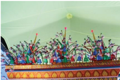
FIGURE 29 Artisan Name: Chalem Iadnimit