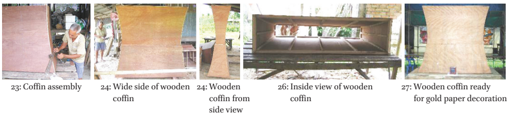
FIGURES 23–27 Coffin Assembly (Office of the National Culture Commission, Ministry of Culture 2006, 51)

Gold and silver foil papers are popular selections for coffin decorations among the artisans of Southern Thailand. They are engraved into Kranok patterns and are known as Daat Khud or Kradaat Khud (engraved bored paper). The decorations usually occur in the same row, which is the base. The coffin body is adorned with typical pale white paper, which is attached to all four sides. After that, the Daat Khud is attached to the body for beauty (Nuthong 1999, 7308). For common folk or the underprivileged, the decorations are limited to the body of the coffin. Gold paper with readymade patterns is usually the decoration of choice and may be coupled with Styrofoam cut into Lai Thai (Thai pattern). The name of the deceased, their age, date of birth, and date of death are also written on the coffin. The coffin is plainly designed, with no base or peak. On the other hand, coffins for respected seniors or the wealthy are