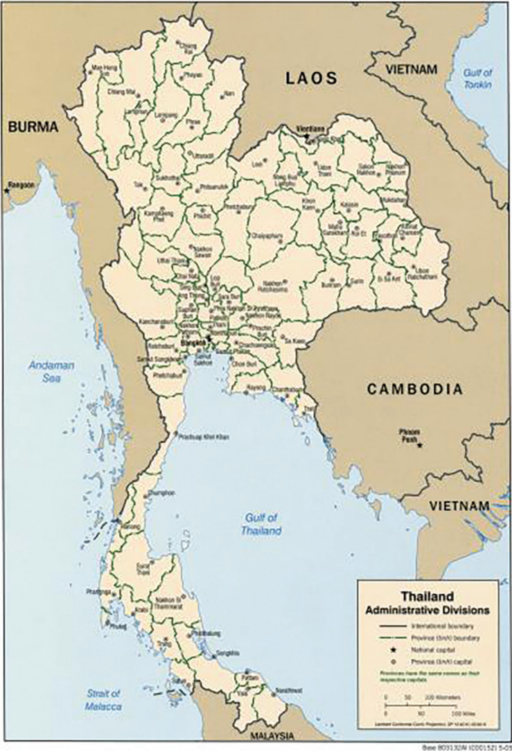
FIGURE 1 Thailand map

resulting in the expansion of Islam to the Malay Peninsula. This belief spread northwards to Southern Thailand and southwards to Indonesia. By the 15 th century AD, certain indigenous people of Southern Thailand started to convert to Islam.