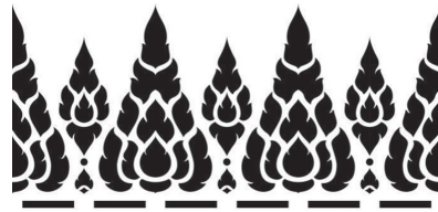
FIGURE 5 The Krui Choeng Pattern (Non-Conjoined)

The Buddha Pulling ritual requires intricate paper cutting techniques to decorate the Buddha Pulling vehicle. The decorations are highly regarded and therefore artisans put their skills into creating distinctively elegant patterns. These patterns differ from their Songkhla counterparts.