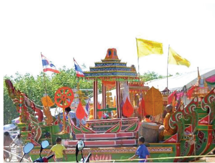
FIGURE 22 Wat Mae Toei's boat has the king of Nagas (Phuyanak) and Wheel of Dhamma design Laak Phra (Chak Phra) festival, Songkhla Province. (Virunanont 2015)