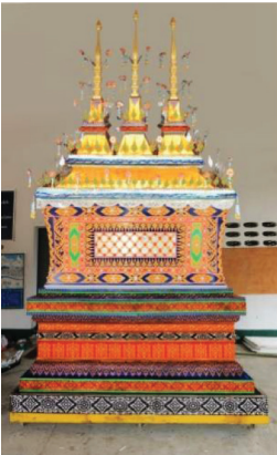
FIGURE 30 Artisan Name: Suan Nudla