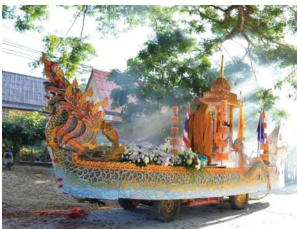
FIGURE 21 Wat Tah Kam's boat has a narrow boat head decorated with king of Nagas (Phuyanak) design Laak Phra (Chak Phra) festival, Songkhla Province. (Virunanont 2015)

Laak Phra (Chak Phra) Festival organized by Songkhla Municipality holds two types of Buddha boat contest (Chak Phra Festival in Songkhla province where more than 30 temples submitted their decorated rafts to the design competition 2019) which are traditional and conservative. It has been found that most of the participating boats were traditional, decorated with foam and other brightly coloured materials, while there were fewer conservative boats and these were decorated with wood and natural materials that are local to the concept of building a boat with Thai designs and combined with home arts.