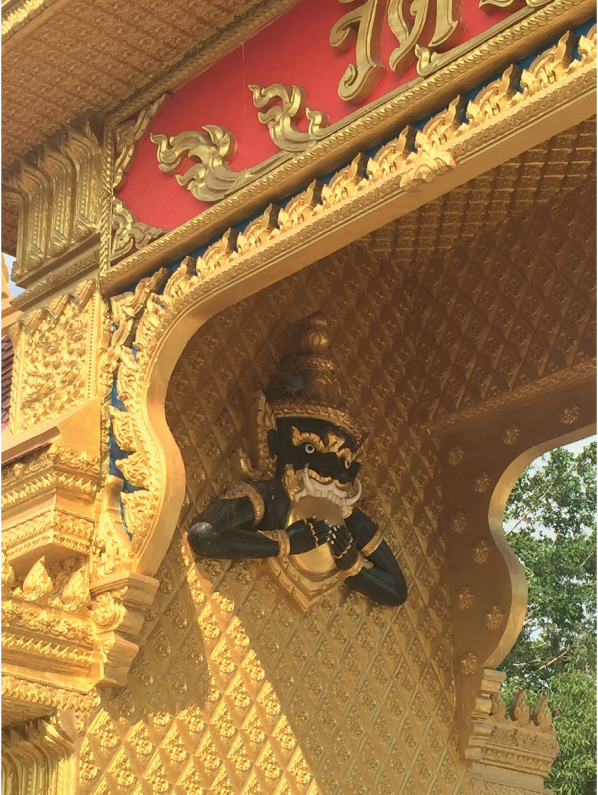
FIGURE 5 Rahu as door-keeper at Wat Nong-or, Chanthaburi

space to disturb the sacred rites. Hence, the symbol of Rahu always exists at the arch or entrance of a Buddhist sacred place. The transmission of the symbol of Rahu through art signifies the god's role as the protector or door-keeper.