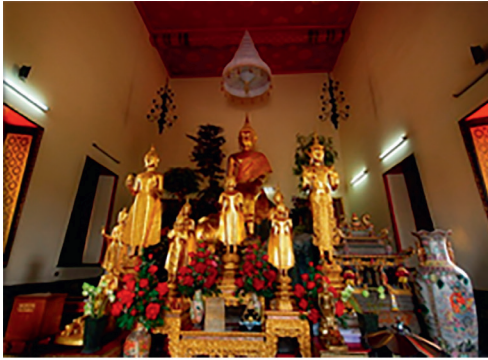
FIGURE 2 Parileyyaka posture at Wat Pho

Another concept in building a Buddha image related to Rahu is to build the Buddha image in the posture of the Reclining Buddha and the big Buddha. Such concepts in building Buddha images cause the Rahu symbol to appear in the area behind the Buddha image. This represents the Asurinthra Rahu that always surrenders to the Buddha's power. The important example is the reclining Buddha image in Wat Phra Chetuphon built in the reign of King Rama III (Fine Arts Department 2015: 28)