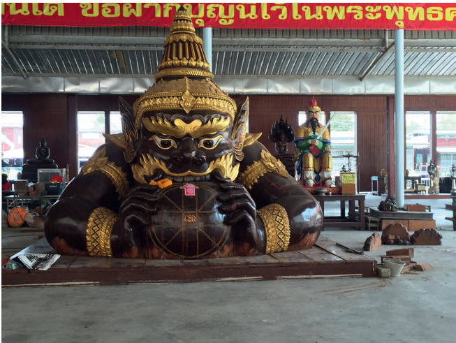
FIGURE 12 Wat Lak Si Rat Samoson, Samut Sakhon