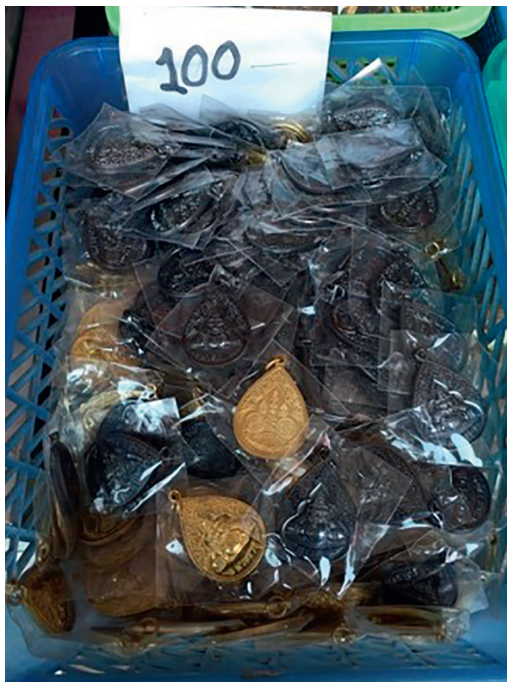
FIGURE 15 Wat Lak Si Rat Samoson Samutsakhon