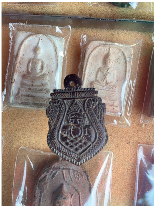
FIGURE 16 Wat Srisathong, Nakhon Pathom