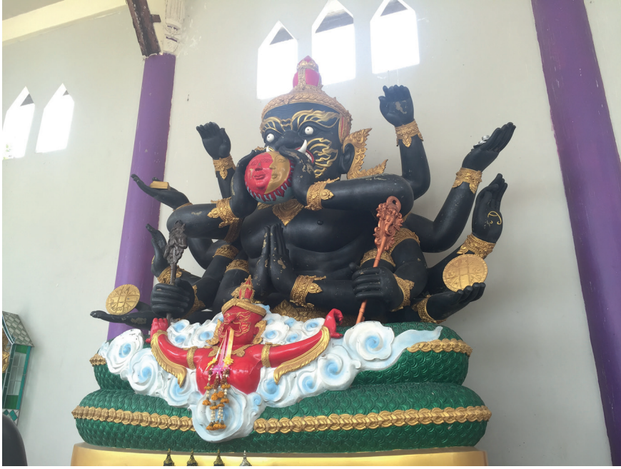
FIGURE 19 Wat Tho Yai, Chonburi

came to visit the temple and it became famous and earned sufficient income for development and expansion.