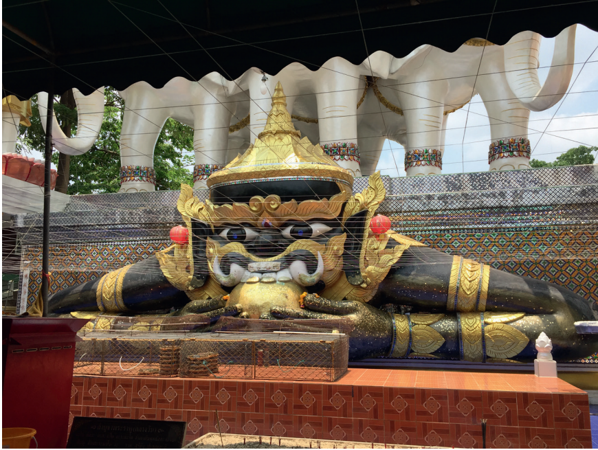
FIGURE 14 Wat Khunchandr, Bangkok