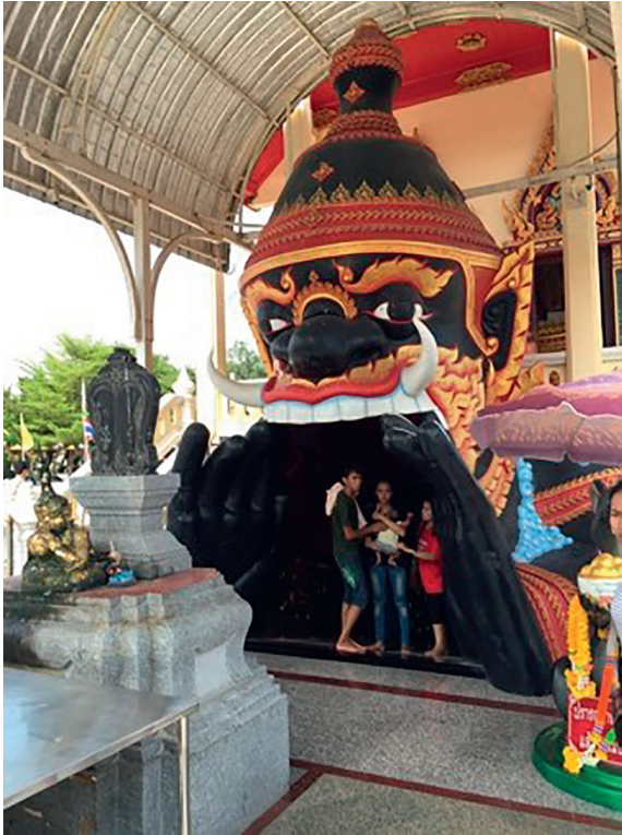
FIGURE 9 Rahu of Wat Chong Samae San, Chonburi

income from the art consumer who needed mental support. Therefore, this factor was a key reason for placing the symbol of Rahu in current Thai society