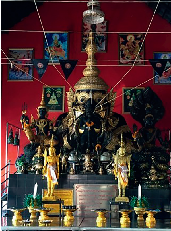
FIGURE 20 Wat Tamai, Samutsakhon