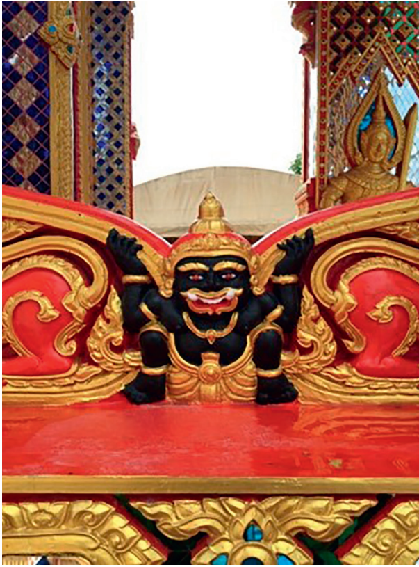
FIGURE 6 Rahu as door-keeper at Wat Huai Yai, Chonburi