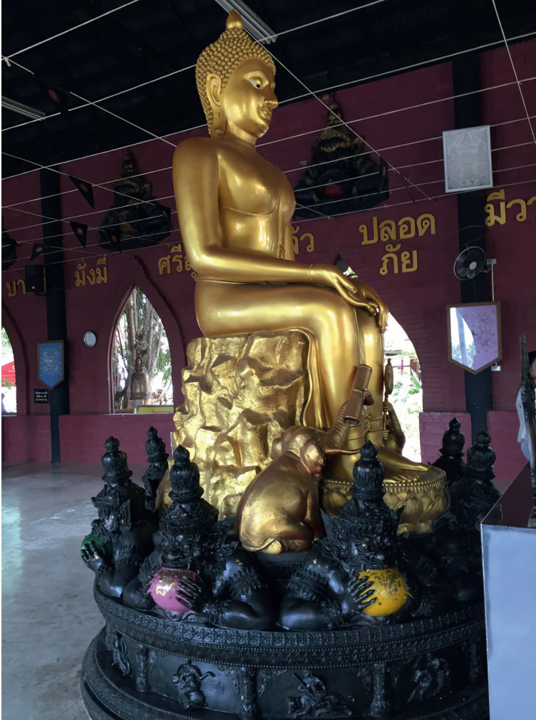
FIGURE 7 Rahu surround the throne of the Lord Buddha at Wat Ta Mai, Samut Sakhon

knowledge and belief in cosmology. The art consumers refer to Buddhists in Thai society who perceive the meaning of Rahu as the sacred god who protects the Buddhist space. Both parties have transmitted the symbol of Rahu as art from generation to generation up to the present day.