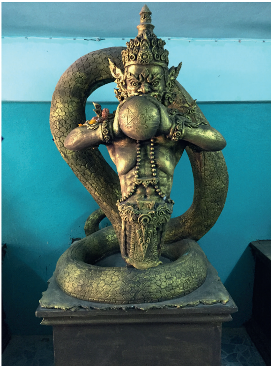
FIGURE 10 Rahu of Wat Bangchak, Nonthaburi

Regarding the sculptures of Rahu on Garuda, the author has discovered that the creator was a famous astrologer. The author assumed that this creation aims at making the new difference of the other Rahu. In addition, this character may build and attract people better than the other fearful appearance. Furthermore, the new definition of this symbol sounds favorable.