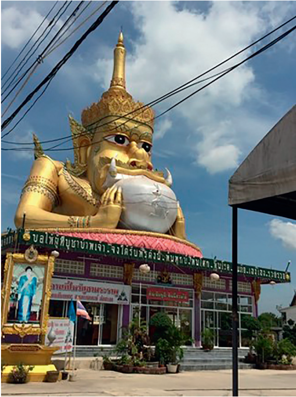
FIGURE 11 Wat Sanamchandr, Chachoangsao