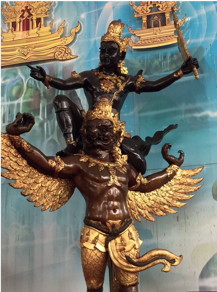
FIGURE 13 Wat Chao Am, Bangkok

According to the data collection, there are two characteristics which are the sculpture for the demonstration of the holy object and the sculpture for decoration. The creation of these symbols is used only in Rahu with the half body. The author thinks that the creators received influence from the belief in using Asura image as the protector of holistic objects or places. In other words, the image has been adjusted to enhance its attractiveness with a tourism purpose.