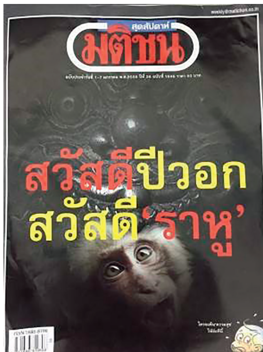
FIGURE 18 Matchon putting the headlines for the New Year with the symbol of Rahu

of the government through belief in astrology and conveyed the meaning to the readers. The government could not take action against the magazine and also fully understood the implications of the artworks.