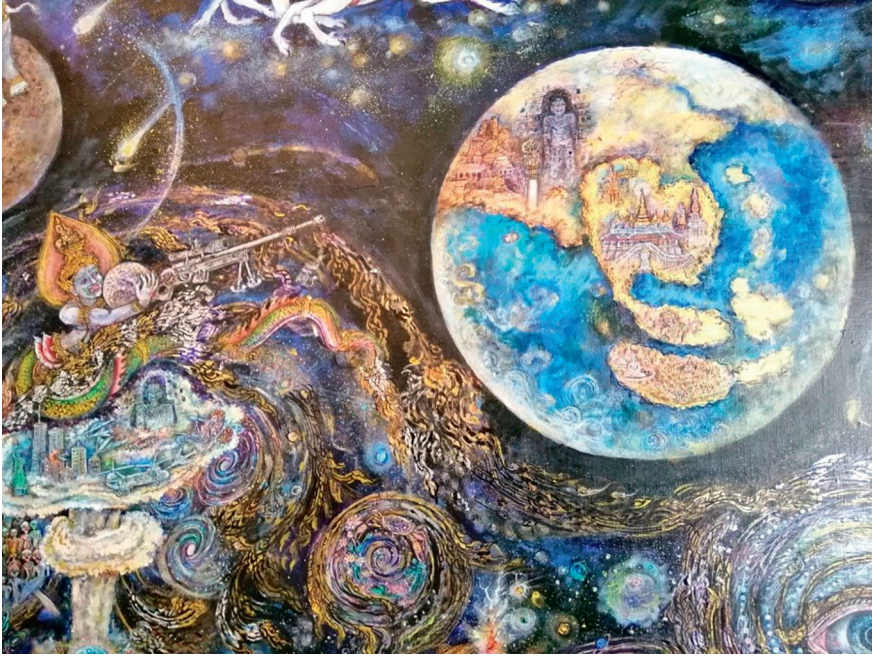
FIGURE 17 Rahu holding a rifle at Wat Saket, Bangkok

From 2005 to 2016 there was a political crisis in Thailand. Political news was reported carefully, particularly during the coup d'état period when any criticism of the prevailing situation was restricted and any news items that could cause damage to the government were obstructed. For example, the coup leader and the Prime Minister gave an interview regarding negative news reporting and stated that it would harm the government and the administration.