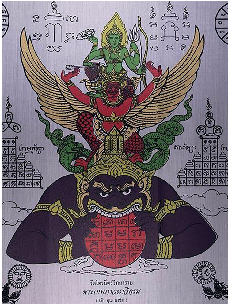
FIGURE 8 Yanta of Wat Tai Mitra, Bangkok

One important factor that led to the development of the Rahu symbol in Thai society was the characteristics and circumstances of Buddhism. In Thai