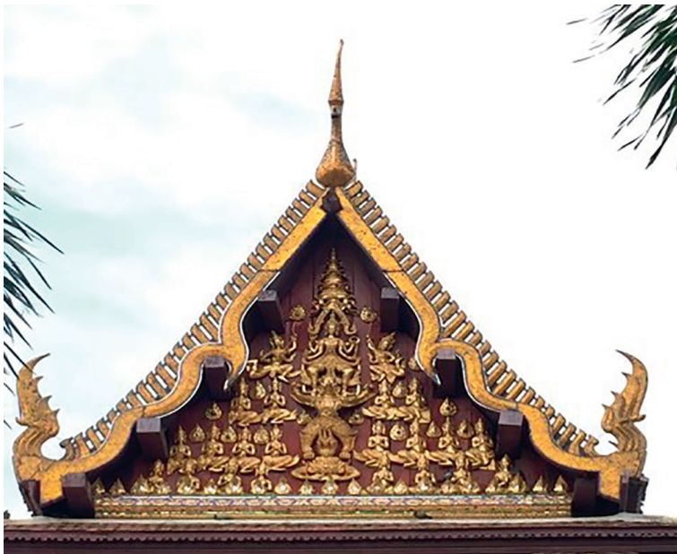
FIGURE 4 Rahu at the ordination hall of Wat Nah Phamen, Ayutthaya

Secondly, apart from constructing Rahu as a component of the universe, the Rahu symbol also functioned as the one that protects the Buddhist space. Buddhists regard temples as sacred areas under the protection of deities and the symbol of Rahu was constructed to prevent evil from entering the sacred