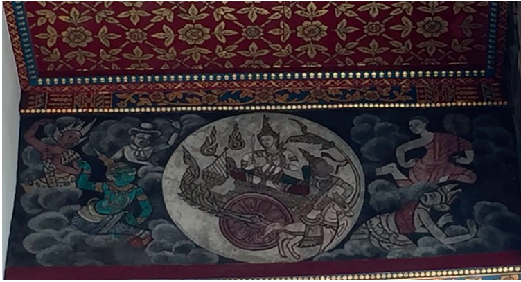
FIGURE 1 The painting of Rahu in the ordination hall of Wat Pho

From documents and data collected during the field research, the Rahu symbol has not only been transmitted in its original form but has also been recreated in various new designs. The factors relating to the transmission and recreation of the symbol of Rahu in Thai art have been analyzed to explain the persistence of the Rahu symbol and beliefs.