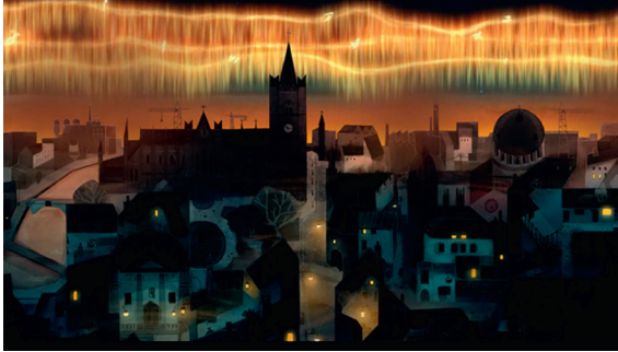
FIGURE 7 Song of the Sea . The Resurrection of Celtic Culture

seals signifies Ben's union with his cultural roots. On the other hand, Conor can make peace with his loss and accept the reality that Saoirse too is a selkie. As he puts it when he sees Saoirse singing the song of the sea, "She's a selkie".