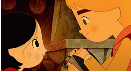
FIGURE 5 Song of the Sea . The Developing Bond

where Saoirse treats his scratched legs with the herbs she has found. Ben smiles as she is treating his wounds and says "Thank you" as illustrated in the close-up in "Figure 5". This "two shot" captures both Saoirse and Ben's familial love as the frame highlights their smiles, connoting their sense of understanding. This heartwarming scene also points to how their relationship has developed over the course of their journey. We can see the glaring differences in the way he treated his sister back when he blamed her for his mother's disappearance.