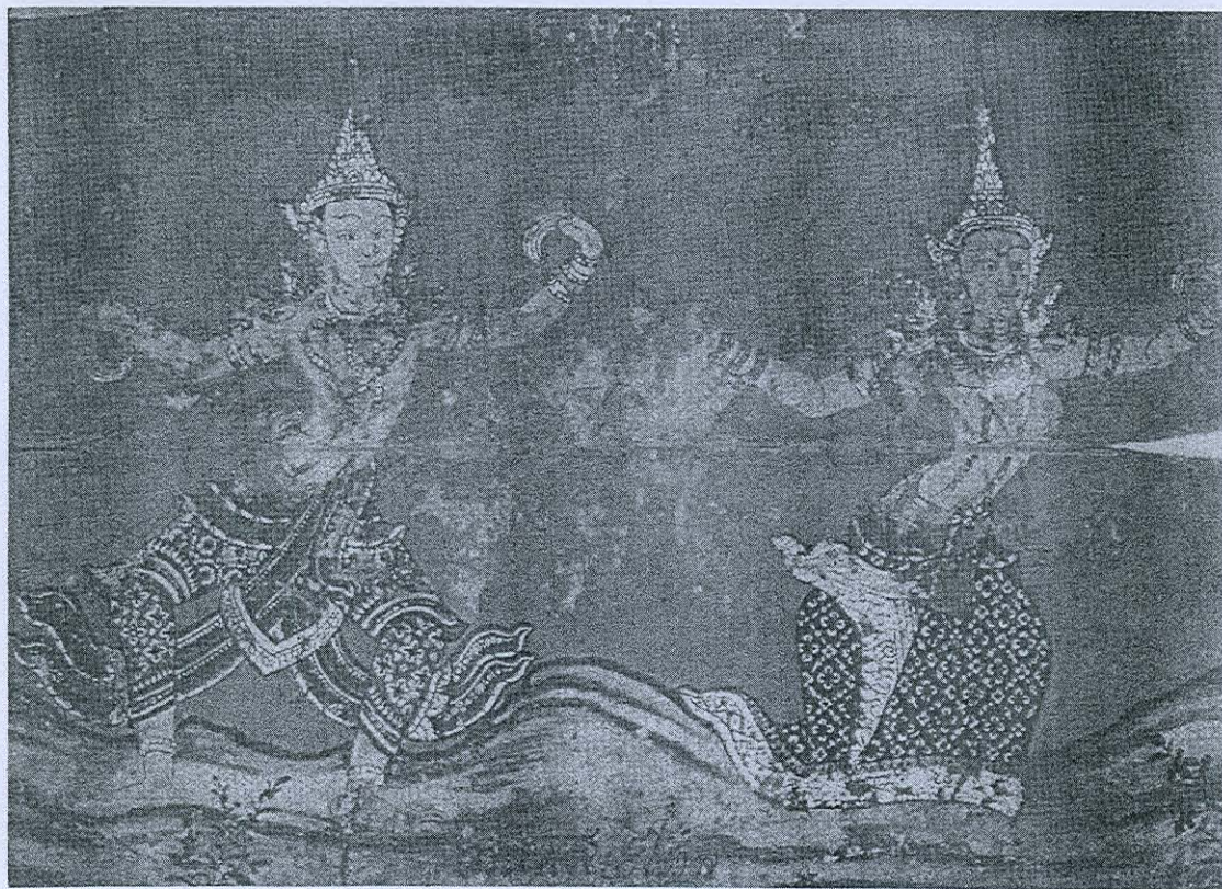
A miniature painting of a master dance posture Pala Pienglai in Tamra Ram (Dance Book) produced during the reign of King Rama I

(Photocopied from Tamra Ram , Bangkok : Department of Fine Arts, 1997. Page 16)